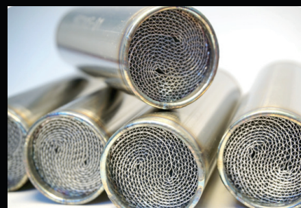
Honeycomb cylinders, the core of the Falkenhagen reactor

project, 'Innovative Large Scale Energy STORagE Technologies & Power-to-Gas Concepts after Optimisation' (STORE&GO), involves the demonstration of three different PtG concepts in: Falkenhagen, Germany; Solothurn, Switzerland; and Troia, Italy. The work builds on previous research that has demonstrated the technical feasibility of PtG technologies, and seeks to further enhance the technology's ability in order that it can be integrated into the daily operation of European energy grids.